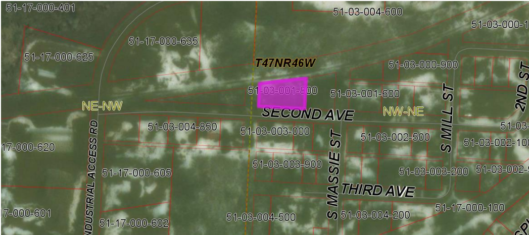
51-03-001-800, 2nd Ave