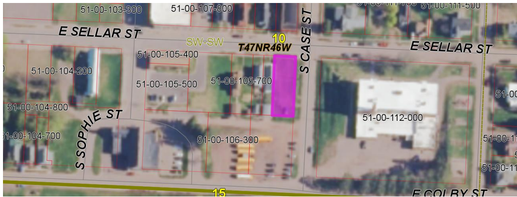
51-00-106-000, corner of Case and Sellar, may have a foundation buried