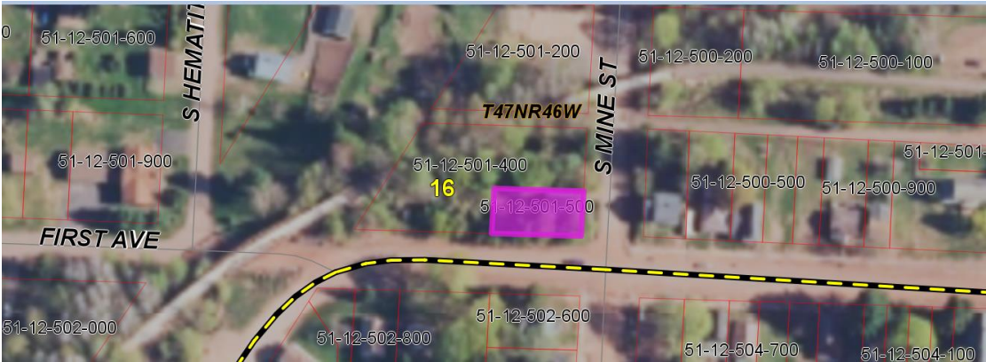
51-12-501-500 506 S Mine St house removed, foundation in place