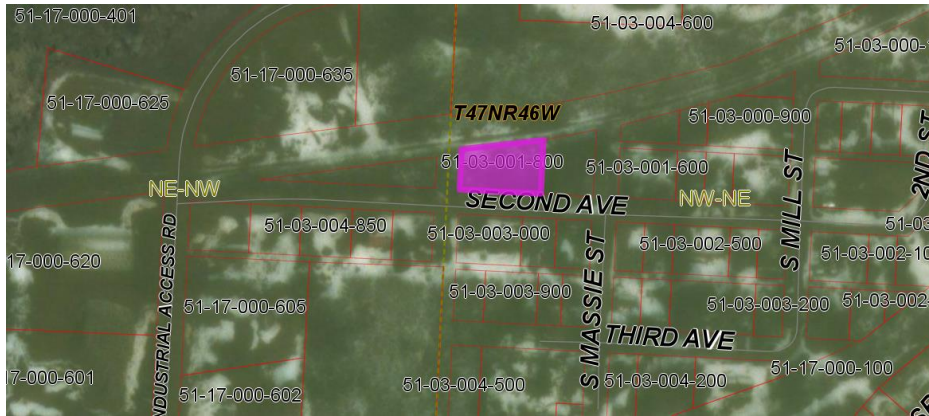
51-03-001-800, 2nd Ave .53 acres