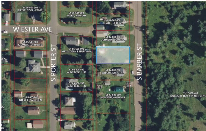
51-17-003-100 1802 S Barber, house removed, foundation in place .165 acres